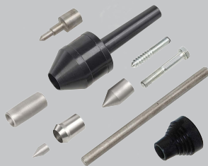
SKU 5015 Life Center System