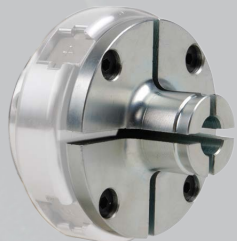
SKU JSPIN Pin Jaws

Follow us on Facebook Facebook.com/NOVAwoodworking