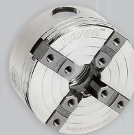
SKU 48290/48291 PRO-TEK G3 Chuck SKU 23262 - PRO-TEK Supernova 2 Chuck