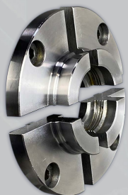
SKU 6090 1" Hornung Jaws